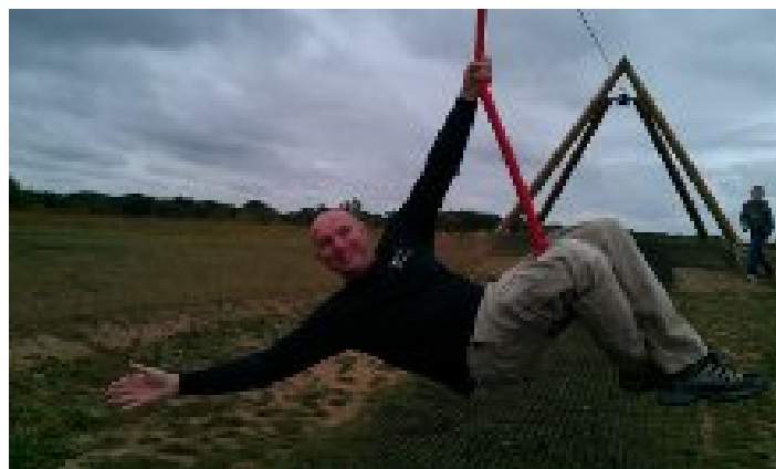
Zip wire recently installed at Westlands Country Park

Telephone: 01206 542255 Email: info@grassrootscharity.org Web: www.grassrootscharity.org www.coryenvironmental.co.uk