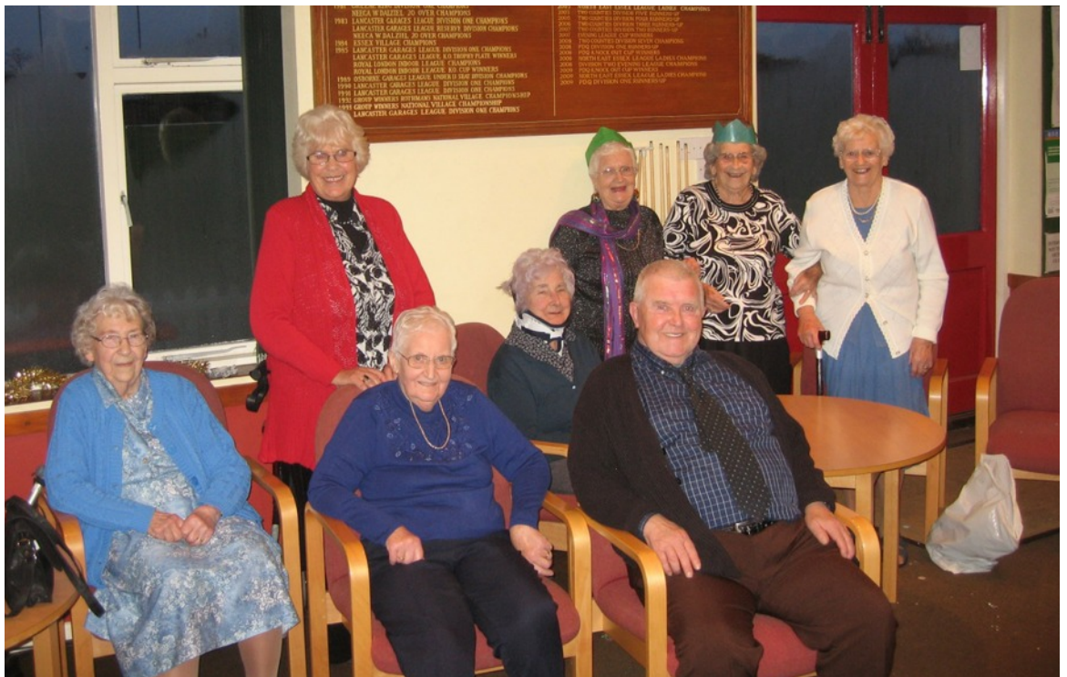
Members of Abberton Good Companions Club enjoying their Christmas celebration.